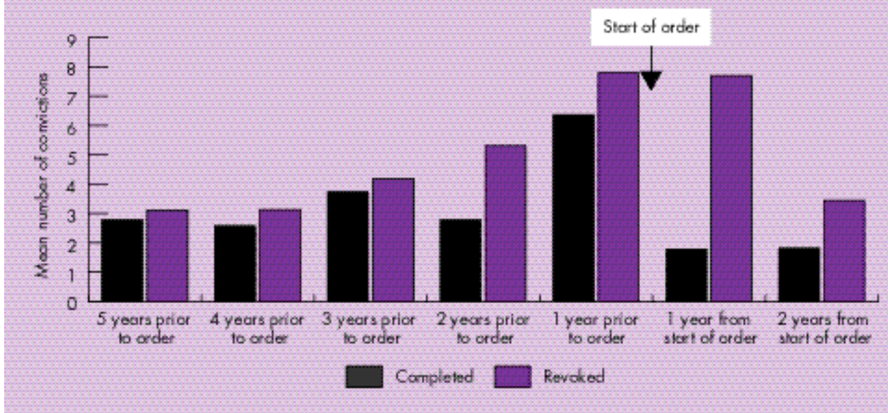
Figure 2 Trend in conviction rates by outcome of Drug Treatment and Testing Orders (n=157)

In the first year after the start of the order, the conviction rate fell very steeply for the group who completed, but only marginally for those who were revoked. In the second year after the order, the group of completers continued to have a conviction rate that was lower than in all the five years preceding the order. The revoked cases show a marked fall in conviction rates from the very high rates in the years immediately before and after the order was made. However, a large part of the explanation for this is that a significant proportion would have received custodial sentences when their order was revoked, limiting their opportunities for offending. The completers, by contrast, had the opportunity to offend, but – in general – did not act on this.